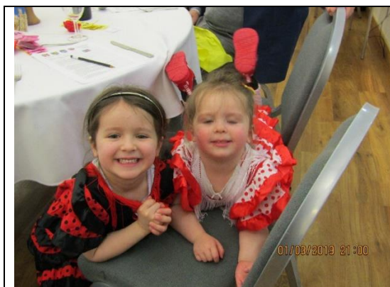
Belles of the Ball

Just a few of the words used after the event. And the pictures tell it all.