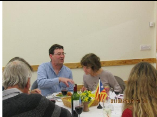
Ah! We know the answers. It's easy with a glass of wine.