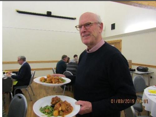
Some like it hot – and lots of it!