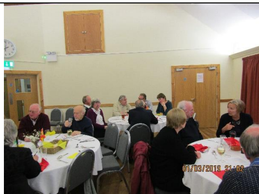
Salud! That's the word