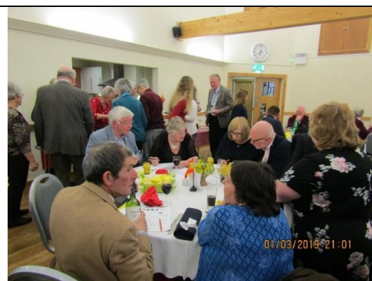
Who set this stupid quiz?