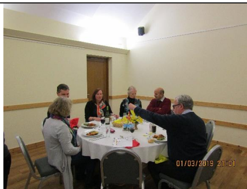
Don't interrupt – we're thinking over here

Keep in touch everyone. If you have any queries about visits, future activities, or anything, please let the Secretary know - glynandlinda.davies@btinternet.com or 01666 823874.